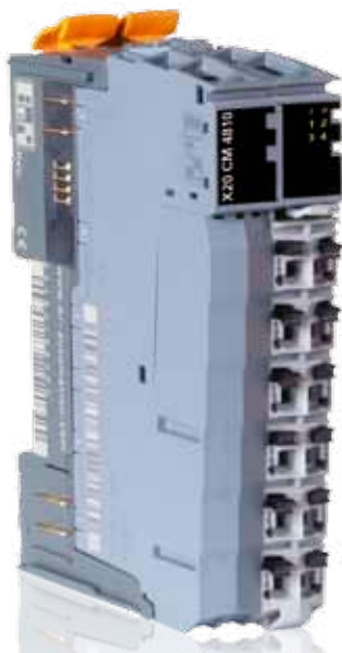
With dimensions of 25x99 mm, the X20CM4810 is one of the smallest 4-channel condition monitoring modules in the world.

maintenance. An advantage of this is that maintenance work can be delayed until it is actually needed, which can be quite a bit longer than conservatively estimated maintenance intervals. In addition, scheduling freedom is retained and maintenance work can be performed during regularly scheduled downtime, such as on weekends. At the same time, this solution avoids risking system failure due to neglected maintenance.