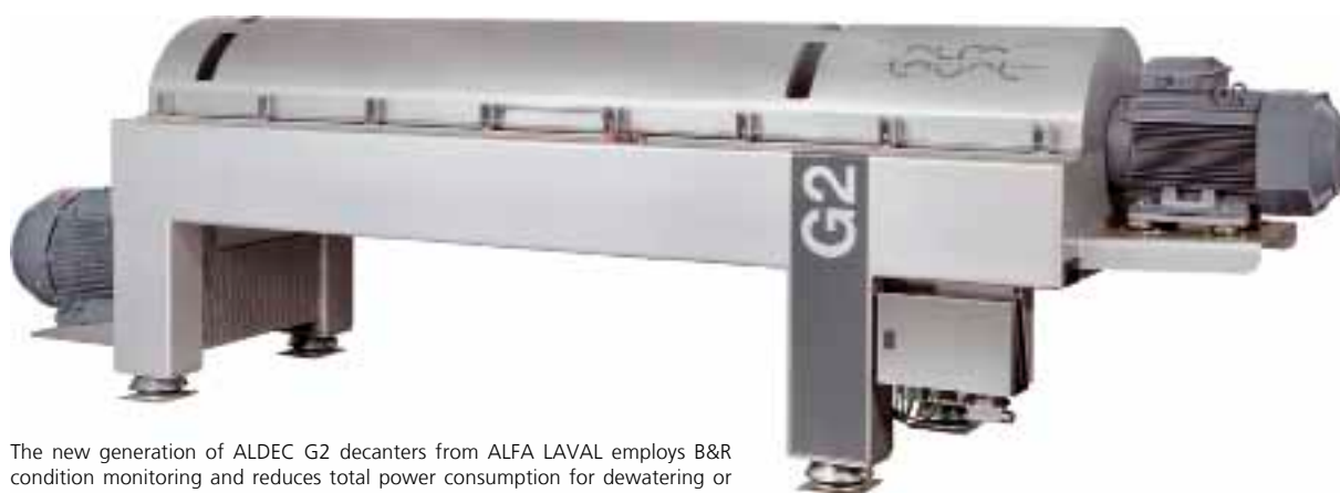
The new generation of ALDEC G2 decanters from ALFA LAVAL employs B&R condition monitoring and reduces total power consumption for dewatering or thickening tasks by up to 40%.

nels for reading acceleration sensors via the standardized ICP sensor interface (integrated circuit piezoelectric), which also serves as the power supply. These signals are sampled at 51.6 kHz and converted into more than 70 parameters directly in the module during runtime.