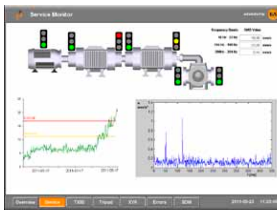
Smart Engineering: Accelerated development times thanks to simple configuration and fully integrated analysis in a single tool – B&R Automation Studio.

Alpha prototype testing at selected pilot customer locations has been ongoing since September 2011. General availability of prototypes is planned for the second quarter of 2012, with series availability to follow in the third quarter. "When we developed these modules, the most important requirement was that they be easy to use as part of an overall automation solution without expert knowledge in oscillation mechanics," explains Waldl. "It needs to be enough to configure the module so that the controller performs the appropriate responses to the values supplied by the X20 slice." ■