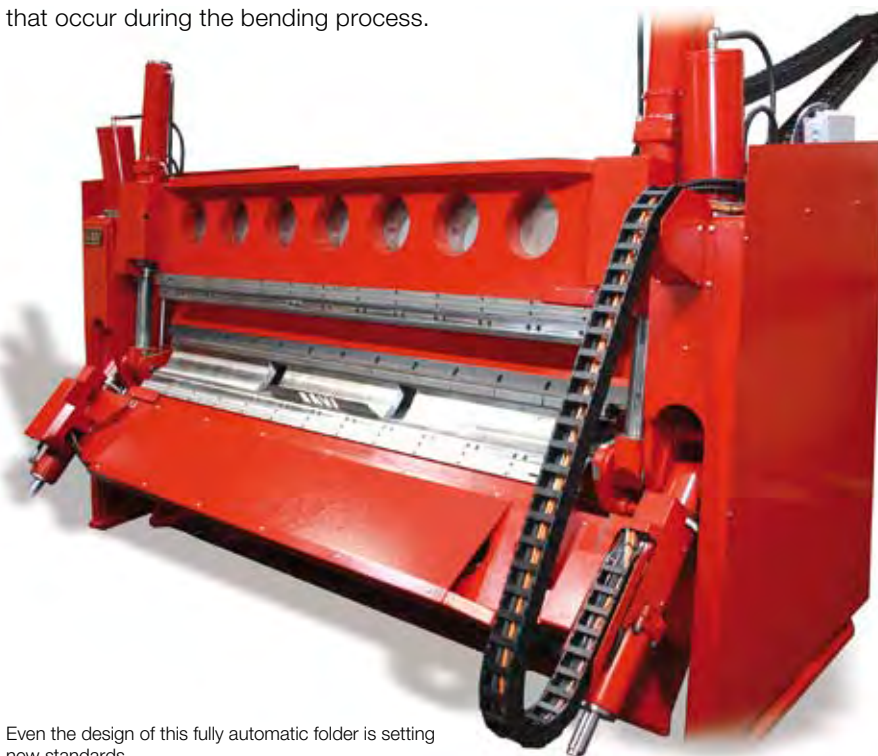
Even the design of this fully automatic folder is setting new standards.

The heavy structure and sizing together with the complete range of accessories, including a hydraulic traction device, make the profile bending machine particularly well adapted for processing beams with sections of up to 500 mm and girders up to 1000 mm. The machine can be equipped with correcting rolls to compensate for the deformations that occur during the bending process.