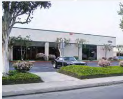
The B&R office in Los Angeles